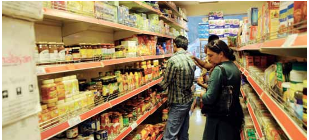
Flavoured tea is increasingly sharing more shelf space with the regular black tea

Says Desai, "Some of the most selling pack sizes are 110, 125 and 250 gm in case of loose tea leaves, and in bags 25 and 100 tea bag packs sell the most. This is because people are being initiated into this tea variety prefer to go for the 25 pack, while seasoned drinkers would go for the 100 pack as it would last for a month atleast."